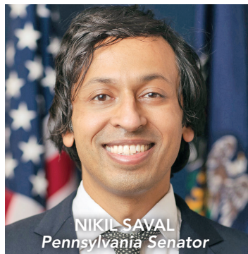
NIKIL SAVAL Pennsylvania Senator