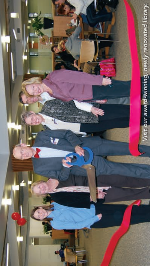
Visit our award-winning, newly renovated library.