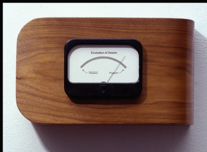
Chris Vecchio, Evolution of Desire , 2000, walnut veneer case, meter, custom circuitry, 12" x 4" x 7 1/4"

SCULPTORS OF THE POST-INDUSTRIAL MACHINE AGE